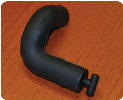
Figure 10: Finished hose part with water works core in