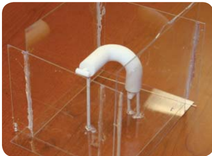
Figure 5: The pattern is mounted on dowels and attached to the floor of the mold box.