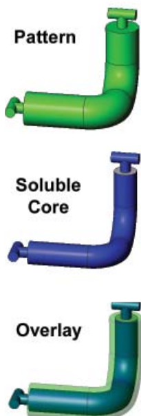
Figure 2: STLs of the pattern and soluble core for a radiator hose. The overlay shows how they are combined to form the internal passage.

RTV molding can produce intricate and complex urethane castings quickly and affordably. In most cases, features that are challenging for machined tooling are easily addressed. However, there is a condition that complicates the RTV molding process. When the rubber mold or a loose insert cannot be extracted from the casting, an alternative approach is needed.