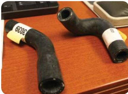
Figure 1: These hoses are examples of parts that need soluble cores since the RTV tool cannot be extracted from the internal passage.