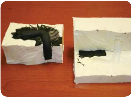
Figure 9: A urethane casting, with the soluble core, prior to extraction from the RTV mold. The black material on the mold's surface is flash from the casting operation.