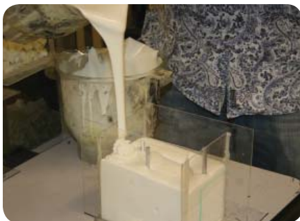
Figure 6: The RTV rubber is poured into the pattern and then allowed to cure.

perform a Boolean subtraction of the part's 3D data from a suitably sized CAD solid. Next, add locators to all points that can be extended out from the casting. These extensions, which are T-shaped in this example, locate and support the soluble core in the RTV mold.