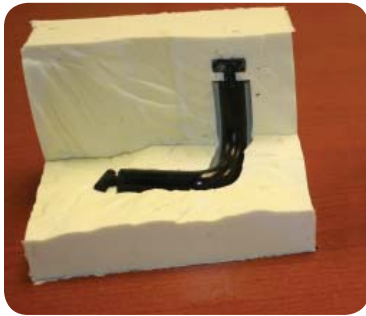
Figure 7: The finished RTV mold with the pattern placed in the mold (left) and WaterWorks soluble core inserted (right).