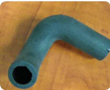
Figure 11: Final hose-part