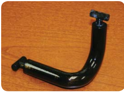
Figure 3: A WaterWorks soluble core for the radiator hose.