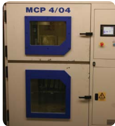
Figure 8: The two-part urethane and RTV mold are placed in the automated vacuum casting machine.

Allow the rubber to cure. The cure time is typically 24 hours, but this depends on the RTV rubber used. After curing, the RTV rubber will be firm, yet flexible.